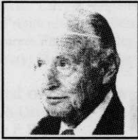
Dr. Hans J. von Ohain

D r. Hans von Ohain was born December 14, 1911, in Dressau, Germany, and received his Ph.D. in Physics from the University of Goettingen in 1935. From 1933, he has devoted himself to the development and improvement of jet engines. He built his first model jet engine in 1935 and received his first engine patent in 1935. At the Heinkle Plant, he built the Heinkle S1, followed in 1938 by an improved S1 in the HE178 aircraft which made the first successful jet flight on August 27, 1939.